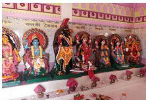
Chaturdas Devata Mandir

ii) चंद्रयान मिशन में शामिल भारतीय वैज्ञानिकों के नाम लिखिए और उनके चित्र भी चिपकाएं।