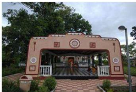
Maa Bhabatarini mandir, Kalishashon

i) उनाकोटी के प्रसिद्ध मंदिरों के महत्त्व के साथ जानकारी एकत्रित कर के चित्र के साथ लिखिए।